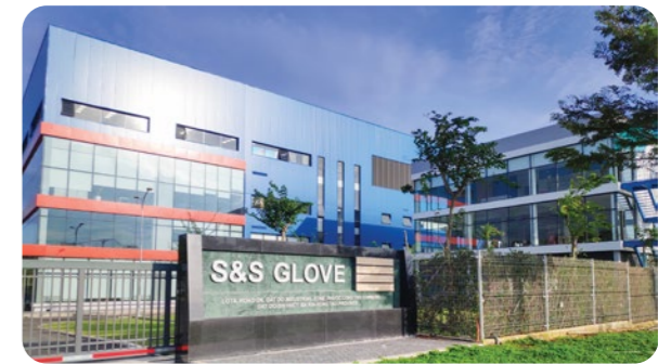
S&S Glove JSC S&S Glove 公司