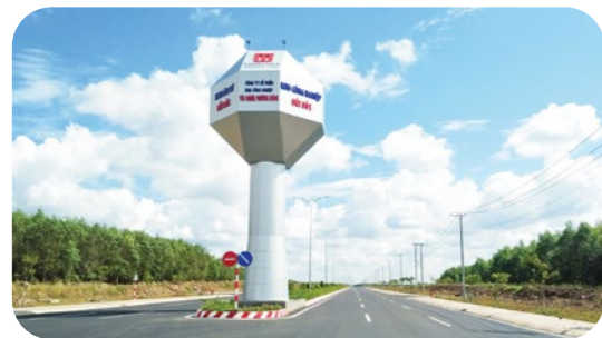
Welcome Gate 歡迎門口