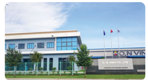
O.N Vina Co., Ltd O.N Vina 公司