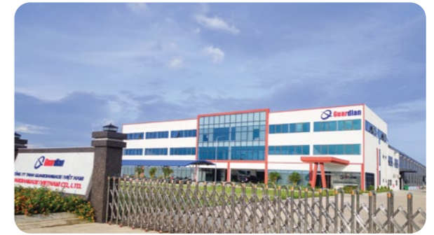
Guardianmade Vietnam Co., Ltd Guardian 公司