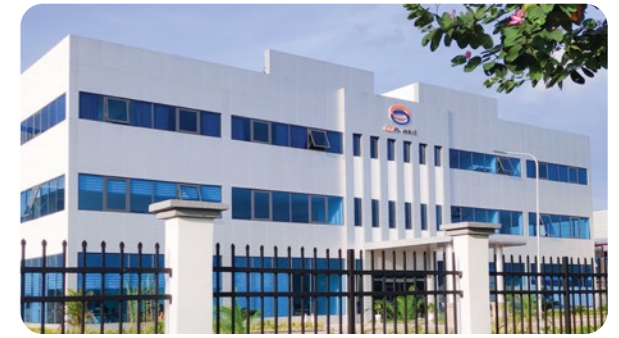
Con-well Metal Vietnam Co., Ltd Con-well 公司